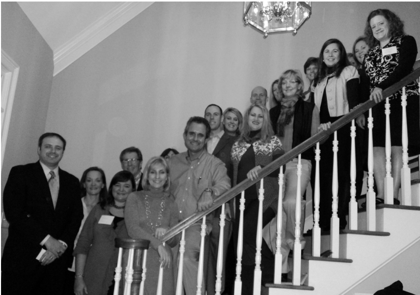
Pictured above, 2011 Board of Directors and incoming 2012 Directors.