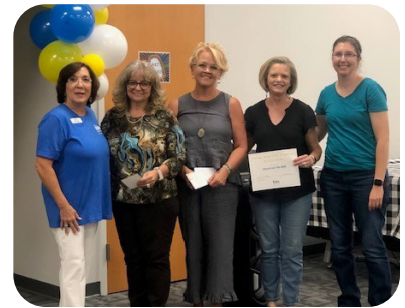
Outstanding Group for Program Involvement Church at the Mill